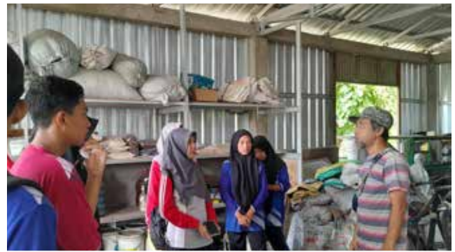
Local students visit Rengel's TPS, seeing firsthand how waste management can bring economic value to the community.

Rengel Village Market in Tuban's Rengel Subdistrict is a bustling hub — and with that comes waste. Every day, over 10 tons of organic and inorganic waste pile up, pushing the village government to find a better solution.