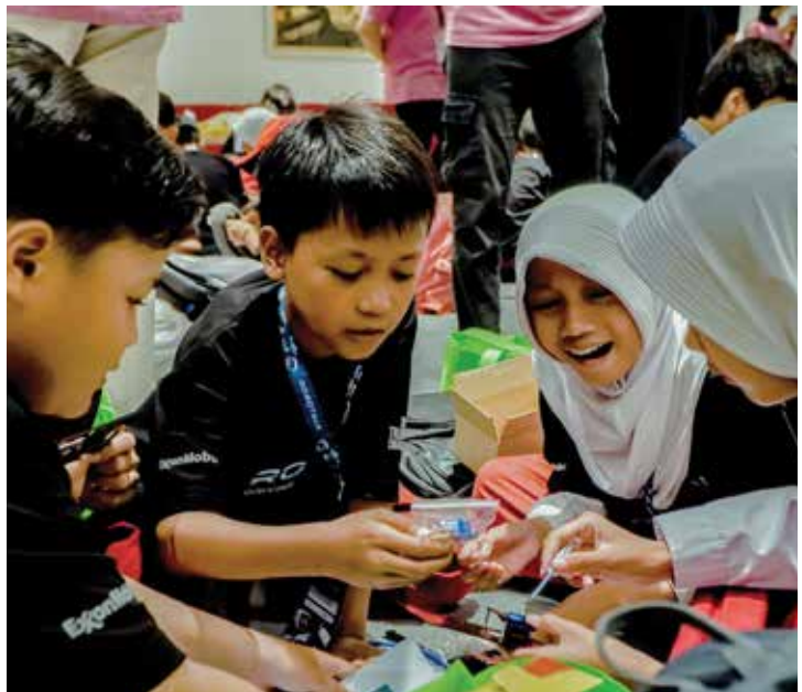
Students practice assembling robot components and programming them to follow instructions and move accordingly.