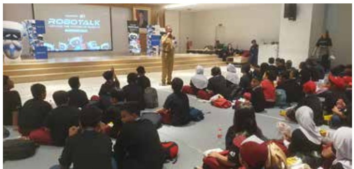
Bojonegoro students enthusiastically join the robotics training and exhibition in Jakarta.

Coordinating Minister for Human Development and Culture, Republic of Indonesia