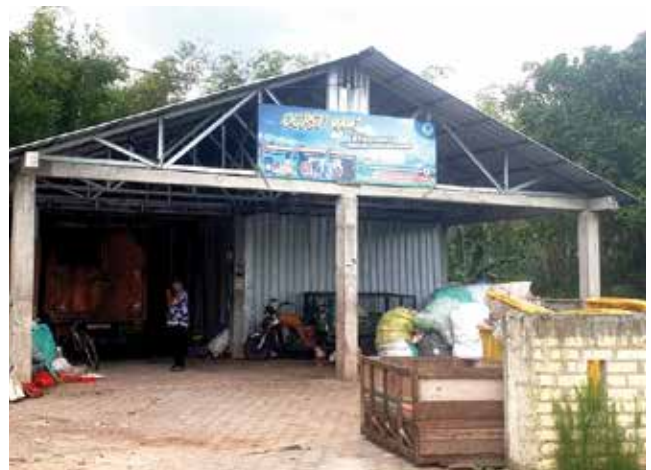
The waste sorting facility in Rengel, built with support from EMCL, SKK Migas, and the Tuban Regency Government.

This progress didn't stop there. Rengel Village now employs dedicated waste workers, creating jobs, boosting income, and ensuring their health through insurance coverage — a testament to how environmental responsibility can empower a community. •