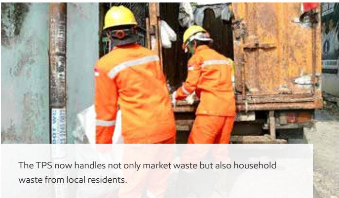
The TPS now handles not only market waste but also household waste from local residents.

Rengel Village's dedicated waste workers, managing the TPS facility built with EMCL's support.